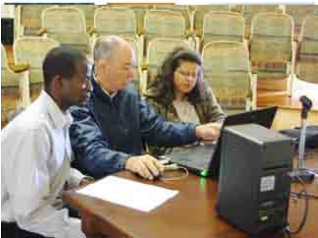
Participants had to work very hard during the course that was presented by Global Network Recordings.