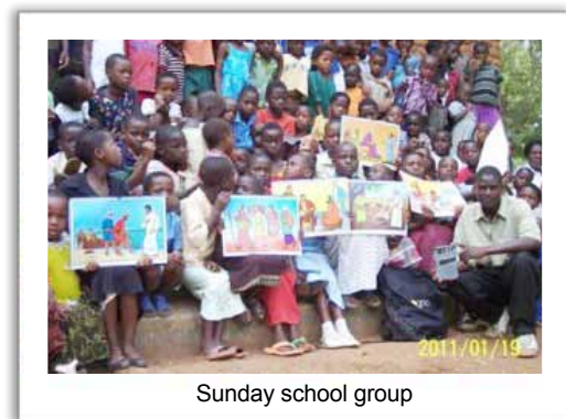
Sunday school group

The figures below explain the huge excitement. During the past 12 months the following could be done: